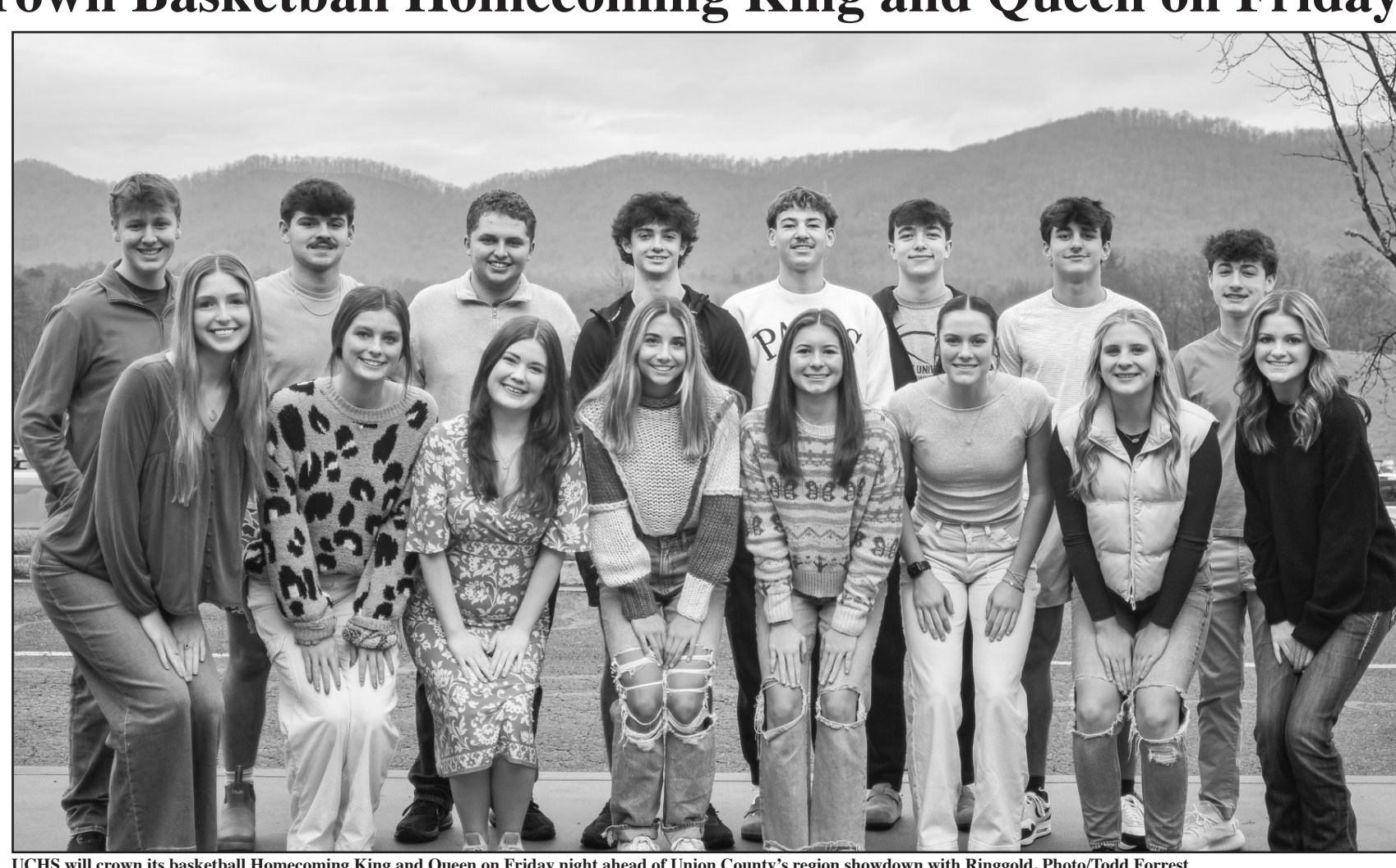
UCHS will crown its basketball Homecoming King and Queen on Friday night ahead of Union County's region showdown with Ringgold.